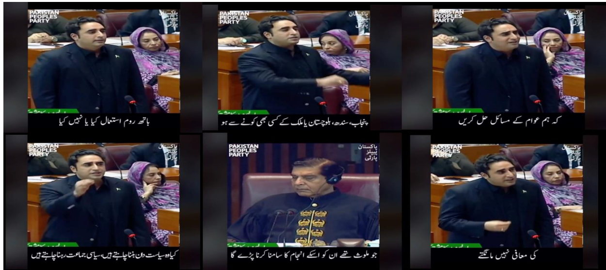
Figure 5: "Until Imran Khan Apologizes for Jannah House Fire"

Reel No. 2 from the PPP official account, titled "Until Imran Khan Apologizes for Jannah House Fire," delves into the charged political discourse between Bilawal Bhutto Zardari of the PPP and Imran Khan. With 7,925 views, 238 likes, and just 1 comment, the reel has garnered moderate attention, reflecting the interest in this particular political narrative (figure 5).