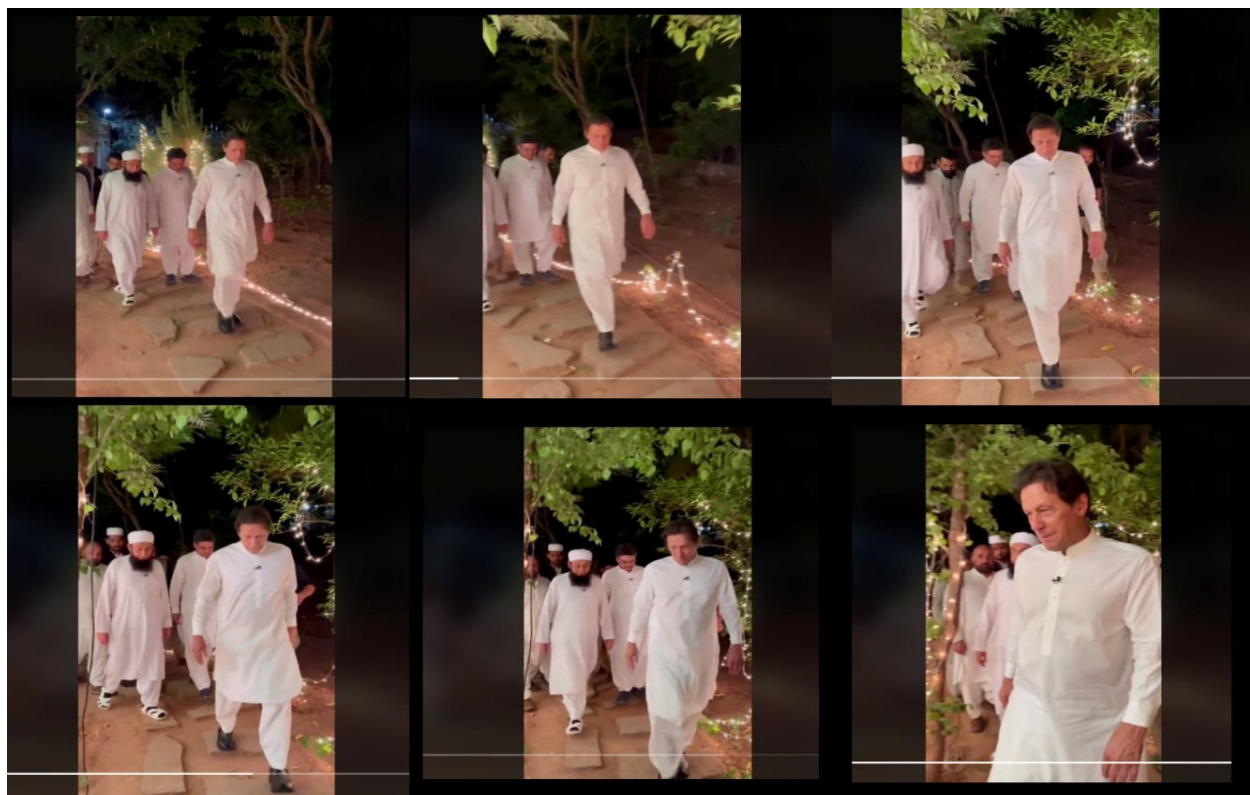
Figure 7: Reel No. 1 “Endorsement of a Political Leader”

Reel No. 1 (figure 7) from Imran Khan's official account, titled "One Has to Face Difficulties in the Path of Truth," illustrates the potent intersection of religion and politics in Pakistan. This reel has achieved significant engagement, with 4.9 million views, 1.4 million likes, and 29.6k comments, underscoring its widespread reach and impact.