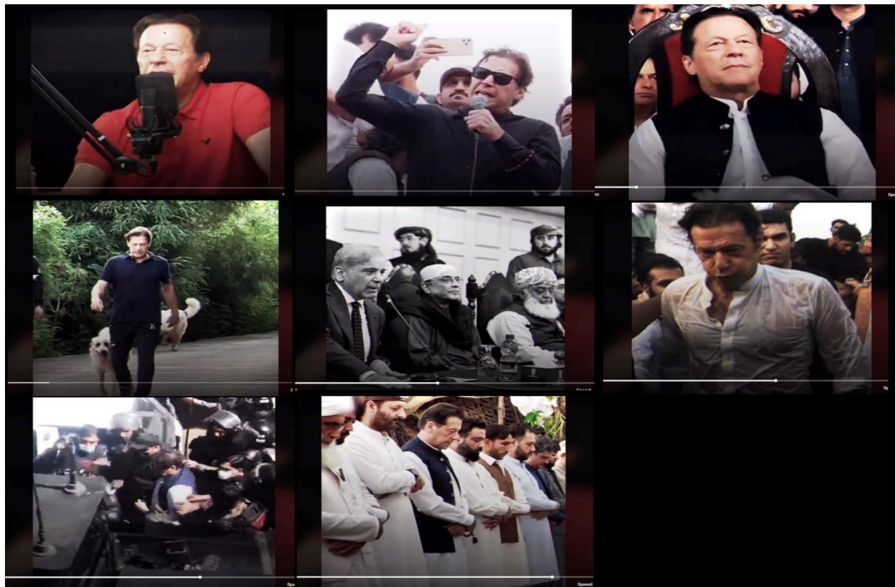
Figure 9: "Use of Religion in Politics"

The reel (figure 9) from Imran Khan's official account, focusing on the "Use of Religion in Politics," is a potent example of intertwining religious ideology with political narrative. Garnering 472.9k views, 163.9k likes, and 8,804 comments, the video has struck a chord with a large audience, reflecting its impactful message and presentation.