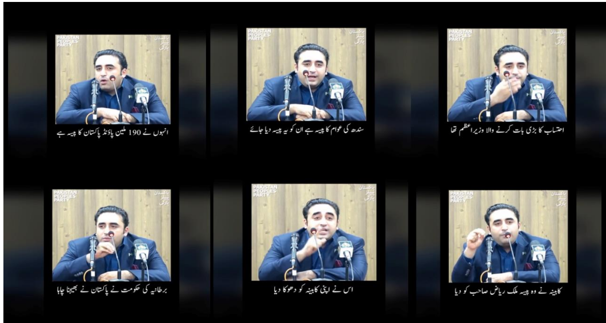
Figure 6: "When Imran Khan had the opportunity to return the 190 million £"