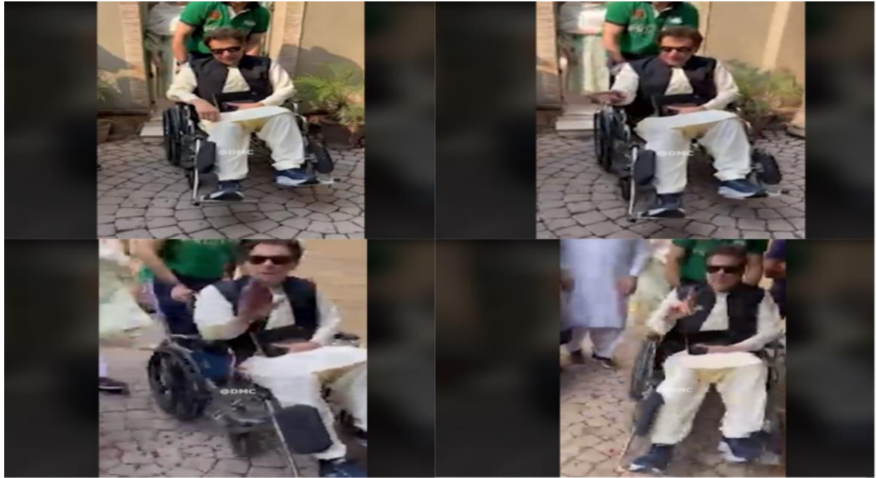
Figure 3: Ankh macholi nhe chaly gi