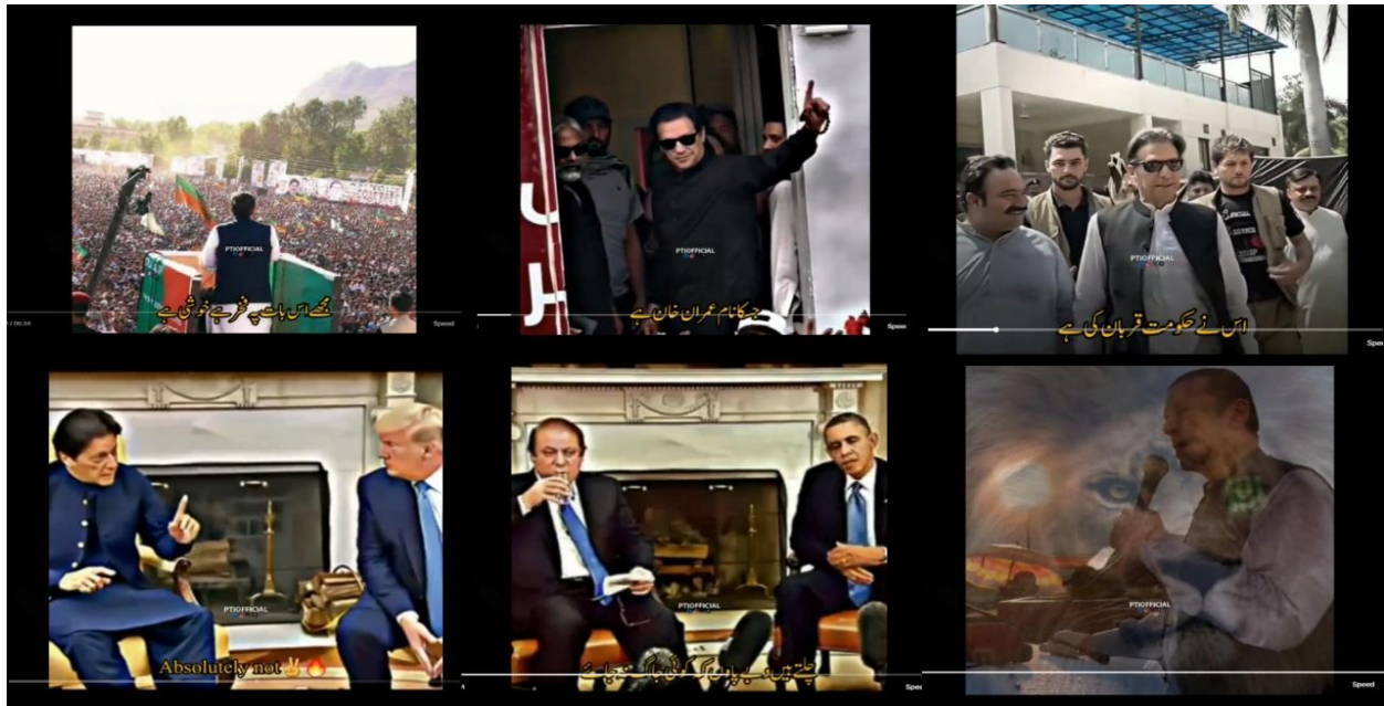
Figure 8: Reel No. 2 “Dramatic Use of Editing & Speech”