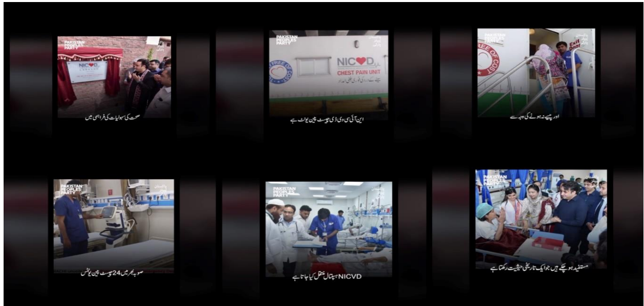
Figure 4: "NICVD Achievements - #ppp #Asifzardari #bilawalbhuto"

Reel No. 1, uploaded on the official PPP account (PPPOFFICIALPK), and titled "NICVD Achievements - #ppp #Asifzardari #bilawalbhuto," presents a narrative focused on the healthcare achievements under the administration of the Sindh government, particularly emphasizing the contributions of the Pakistan People's Party (PPP) (figure 4). The reel, with 3,282 views, 257 likes, and 6 comments, reflects a modest level of engagement, indicating a specific audience interest in the topic.