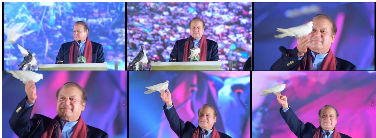
Figure 1: PMLN Reel no: 1

In the realm of digital political communication, particularly on platforms like TikTok, how political narratives are constructed and disseminated holds immense significance. Reel No. 1, titled "Peace returns! #the era of Nawaz Sharif," uploaded by the account PMLN OFFICIAL on 21-10-2023, serves as a vivid example of this phenomenon (Figure 1). This reel has achieved a notable presence online, amassing an impressive 19.5 million views and 1.5 million likes, reflecting its wide reach and impact.