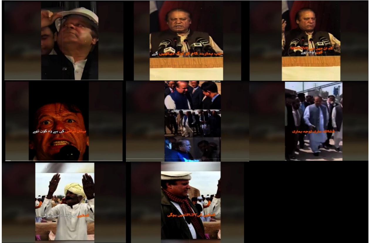
Figure 2: "Kaam gawahi deta he" by PMLN